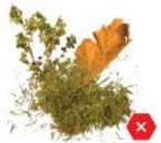
No Yard Waste No Residuos de Jardín