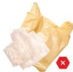
No Loose Plastic Bags, Recyclables in Plastic Bags, or Film Empty recyclables directly into your cart No Bolsas y Envolturas de Plastico Sueltas, o Materiales Reciclables Embolsados Vacíe directamente los materiales reciclables en nuestro carrito