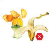
No Food or Liquids No Comida o Líquidos