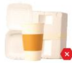
No Foam Cups & Containers No Vasos y Recipientes de Poliestireno