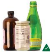
Glass Bottles & Containers Botellas y Frascos De Vidrio