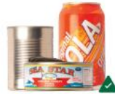
Food & Beverage Cans Latas De Alimentos y Bebidas