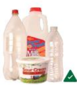
Plastic Bottles & Containers Botellas y Envases De Plástico